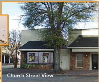
Church Street View

This property is located north of the square in downtown LaGrange. It is one of only a few free standing buildings near the square. It has a brick exterior, carpet tile on the floor, fluorescent lights, sheetrock walls with wainscoting and chair rail in front room. It has two storage rooms, one has all electrical equipment. The half bath is located in one of the back rooms. It is equipped with a security system. Will make an excellent law office, as it is in walking distance to Courthouse. Excellent location for a real estate, insurance, accounting, or like businesses Across from 1st Baptist Church. Good visibility.